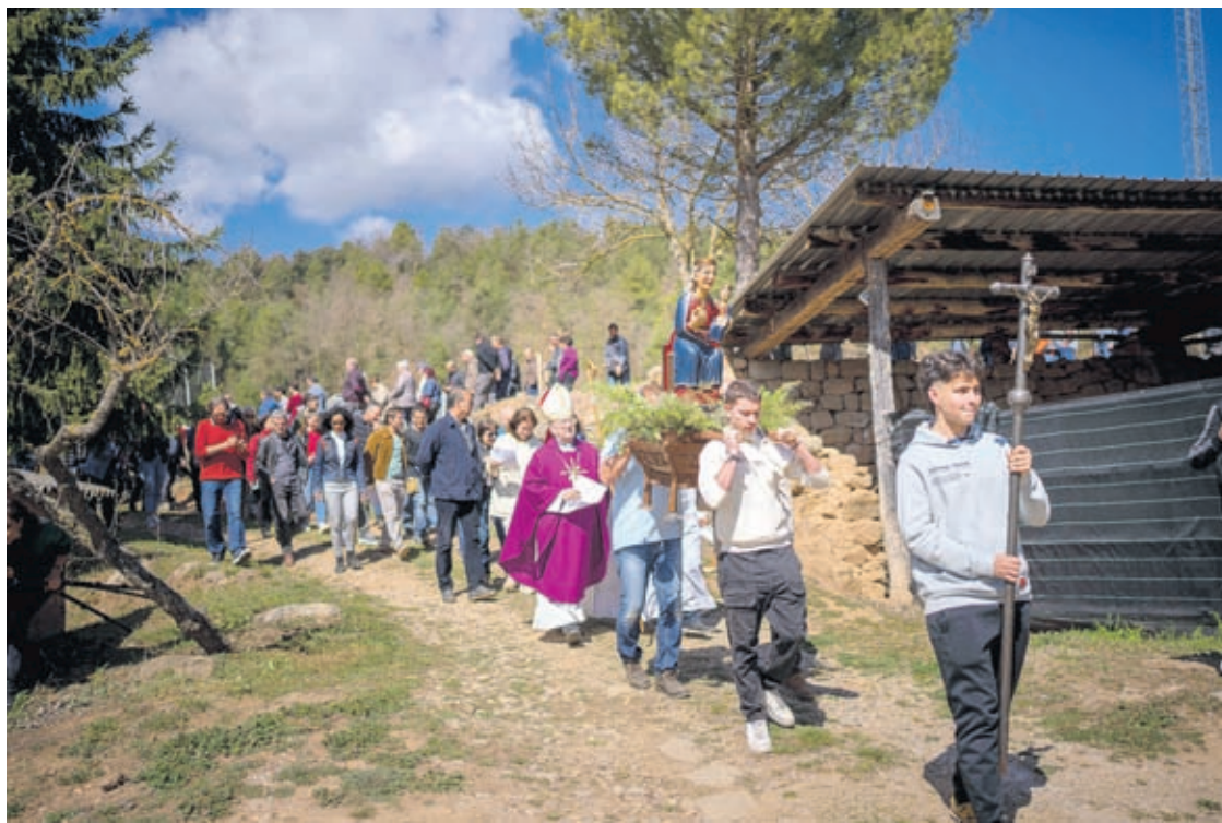
Local residents take part in a procession carrying a replica of the Our Lady of the Torrents, a virgin historically associated with drought, in L'Espunyola, north of Barcelona, Spain, Sunday, March 26, 2023. Farmers and parishioners gathered Sunday at the small hermitage of L'Espunyola, a rural village in Catalonia, to attend a mass asking the local virgin Our Lady of the Torrents for rain. Prayers and hymns were offered to ask for divine intervention in solving the earthly crisis.